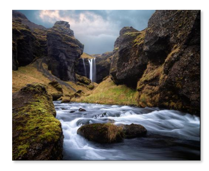
Kvernufoss by Bill Bradford – Best of Show