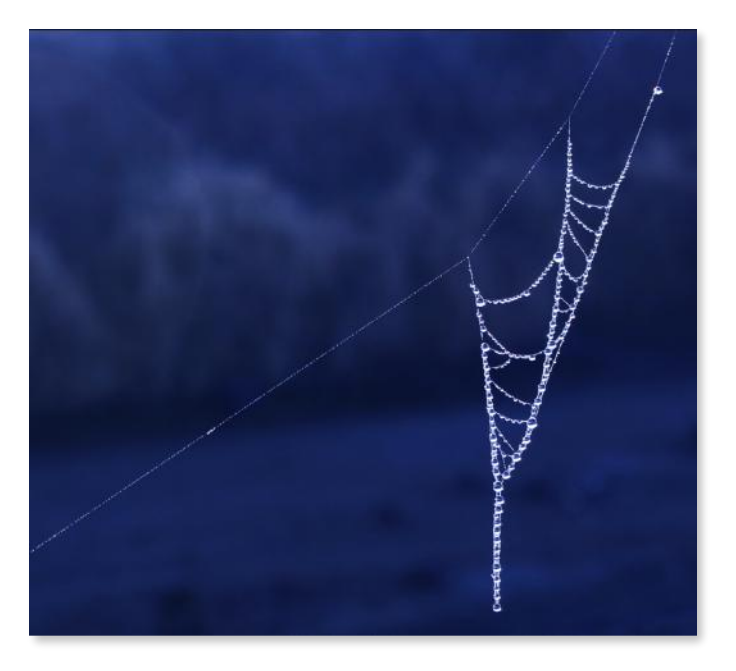
Spider Necklace on Foggy Morning