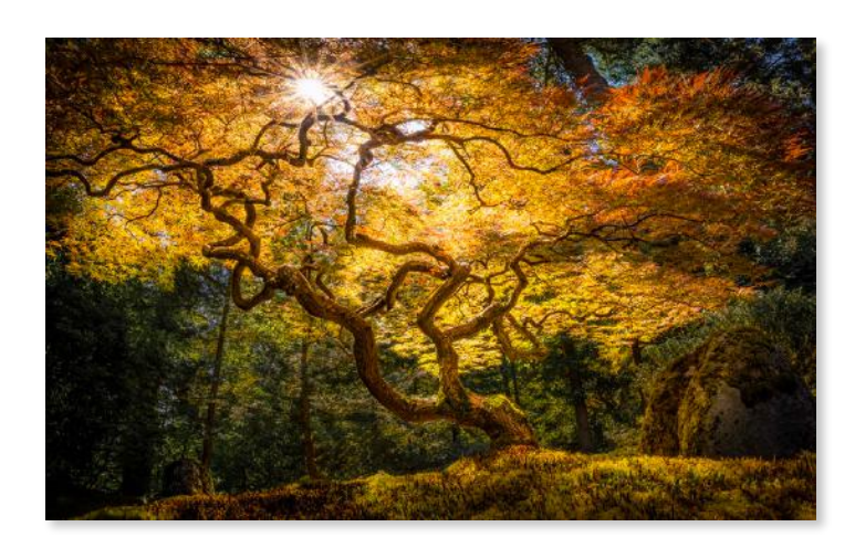
Illumination by Veloy Cook – Best of Show