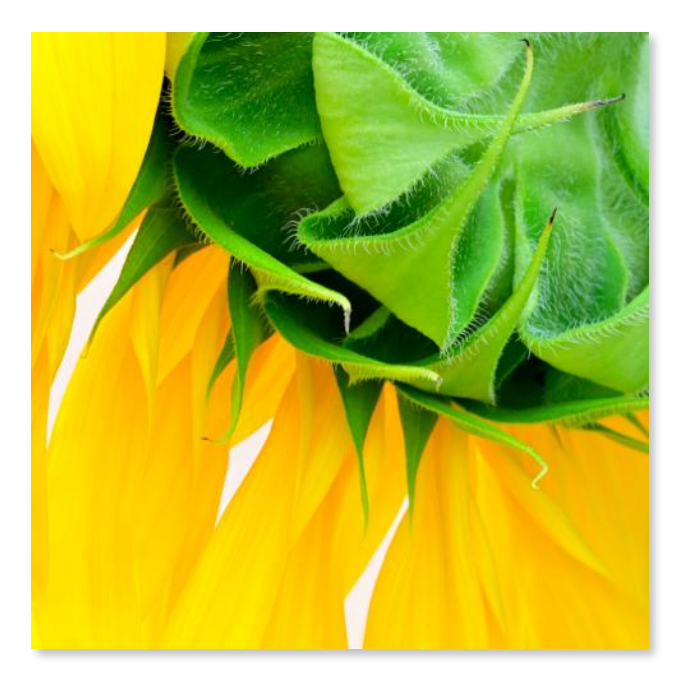
August Beauty 2 by Glenn Eurick