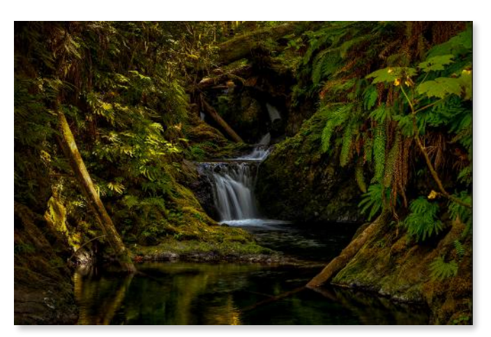
Serene by Paul Baird - Best of Show