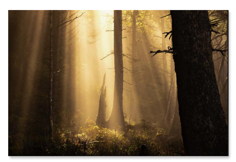
Divine Light by Veloy Cook