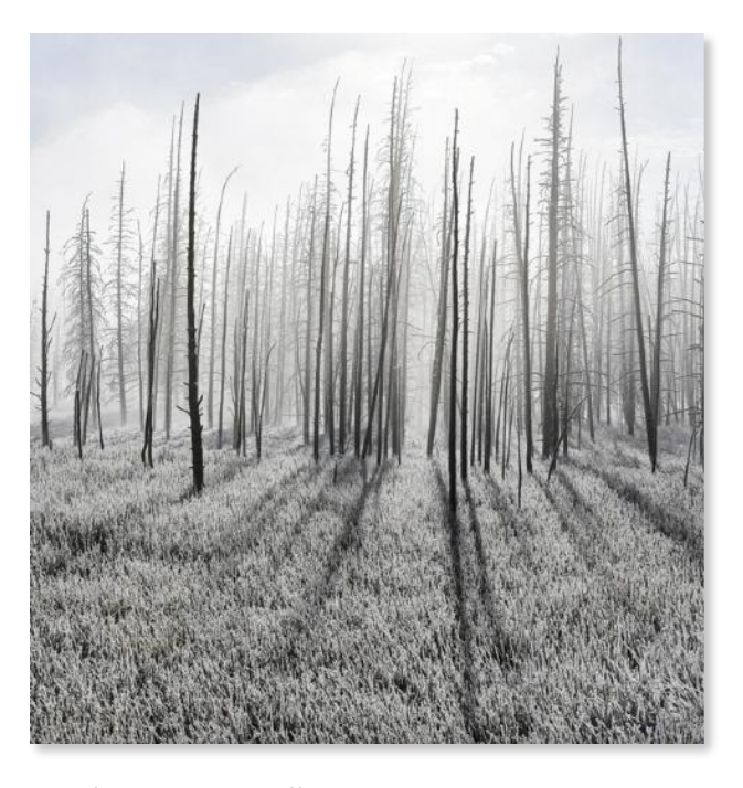
Early Morning Yellowstone