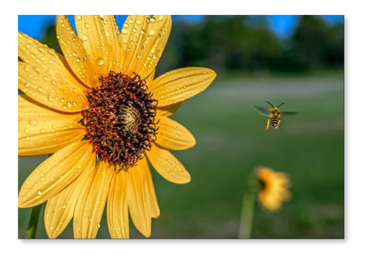
Buzzbee by Carla Duncan – Best of Show