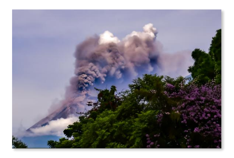
Fuerte Volcano, Guatemala