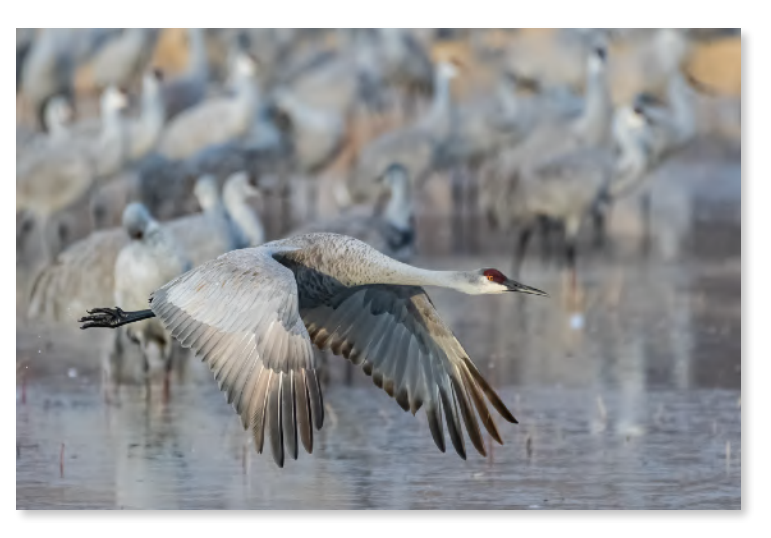
Sandhill Crane Leaving the Flock by James Roach – Best of Show